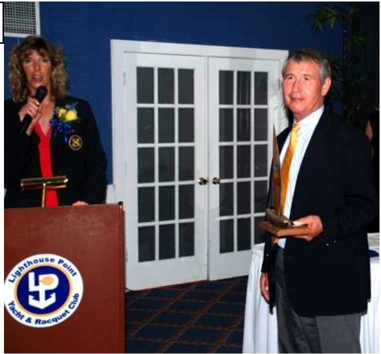
The Adventure Award