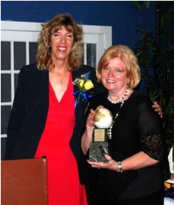
The Global Award