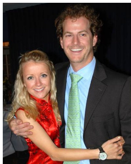
Ocean Sportsman Award