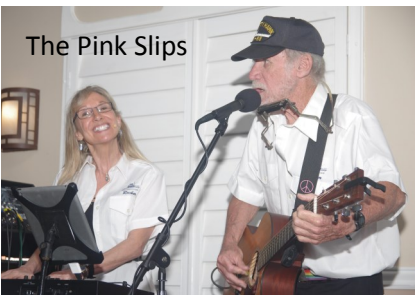
The Pink Slips