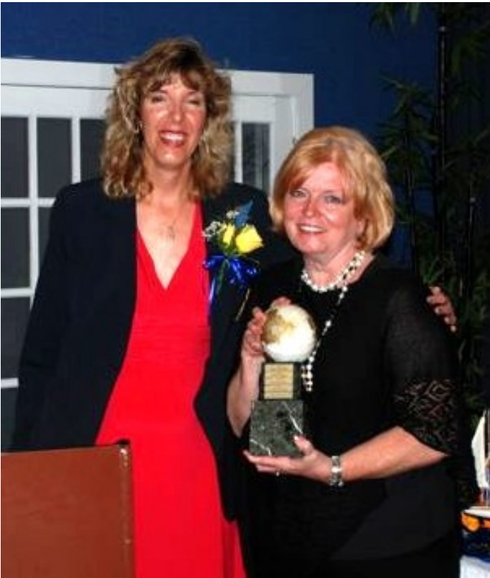
The Global Award