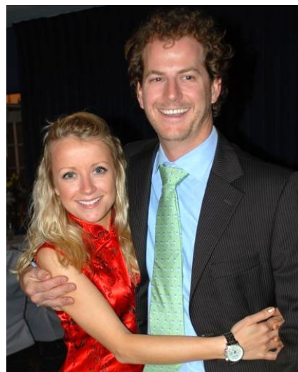
Ocean Sportsman Award