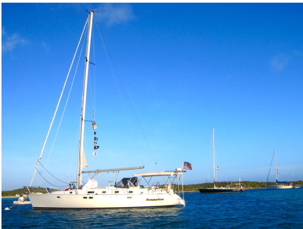
SV Commotion , Full Deck and InSynch at Warderwick Wells