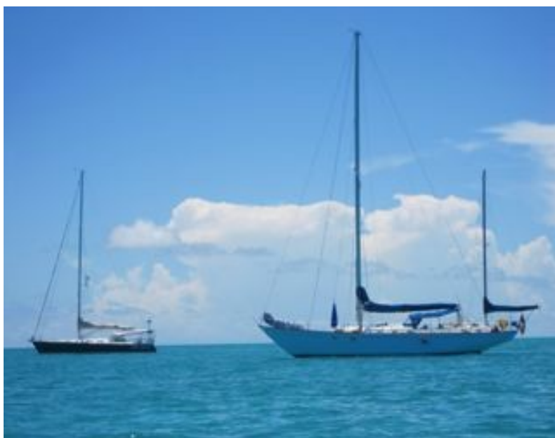
S/V Bonnie and Full Deck in the Bahamas

We woke to the long succession of harmonies of a Bahama mockingbird directly overhead and the comforting visage of our beloved blue yawl, Bonnie , dancing on her mooring. Life is good AND no bugs.